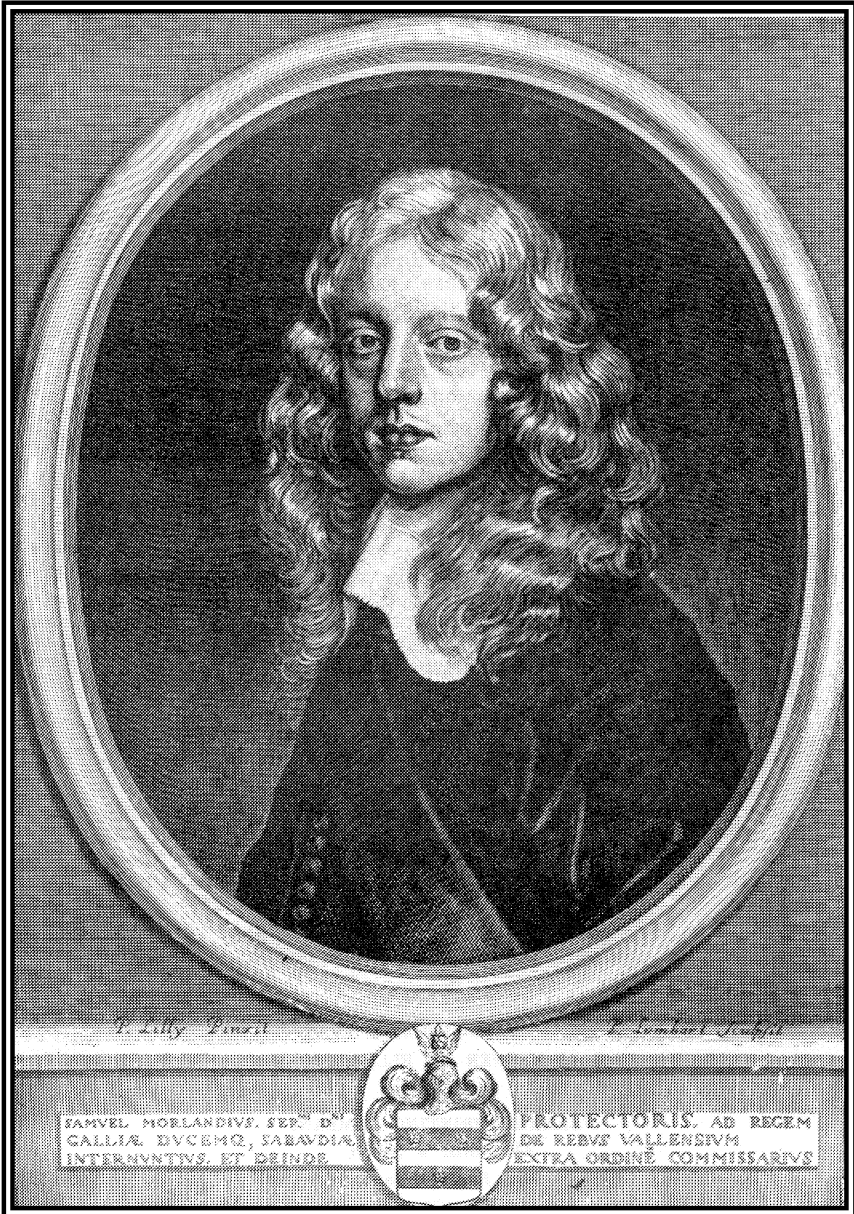
SAMUEL MORLAND 1625-1693